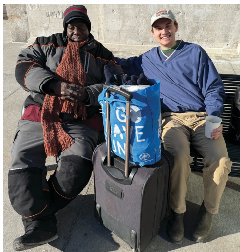
Liberty takes a break to chat during one of his Sunday walks serving coffee.

"It is changing the hearts of the volunteers maybe more than the homeless."